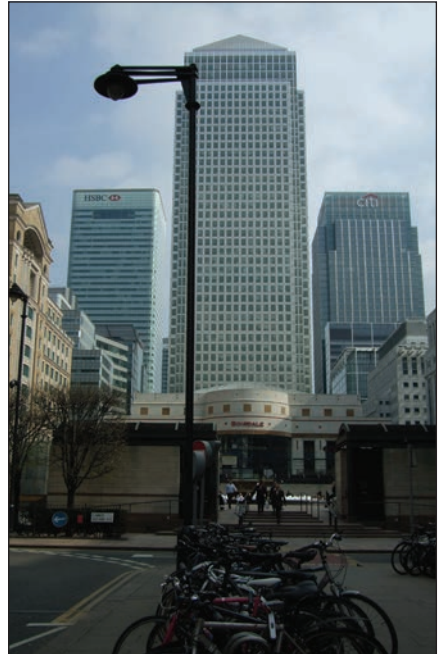
London Docklands - The New