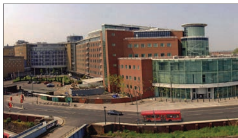
BBC Shepherd's Bush - aerial view