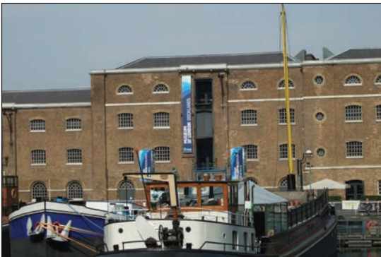
London Docklands - The Old