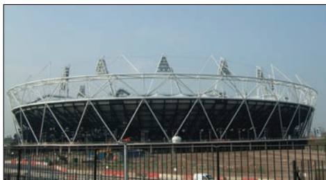
Olympic London - the main arena under construction