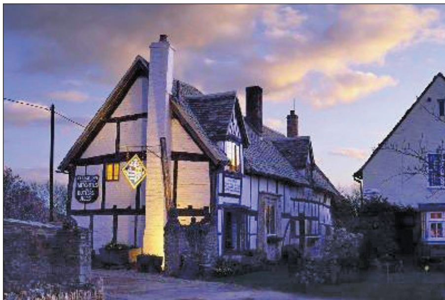
THE FLEECE INN (See page 5)