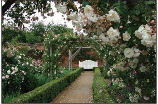
June Roses at Mottisfont