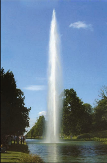
Stanway House Water Garden - the tallest gravity-fed fountain in Britain and the world at over 165 feet.